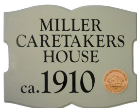
Historic Marker with Medallion mounted. Painted Clear Cedar 14" w x 11.25" h

with a historic marker from the Wilton Historical Society. Wilton is home to some 300 historically significant houses, according to the 1989 Wilton Cultural Resources Survey. Houses in the survey are eligible for historic markers, which consist of a custom-painted all weather plaque with the name of the original owner and construction date of the house, along with a specially cast bronze medallion.